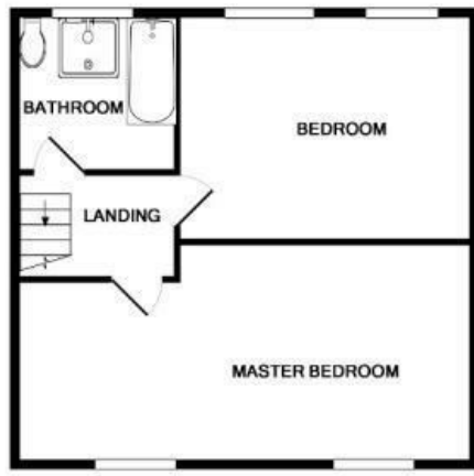
1ST FLOOR APPROX. FLOOR AREA 498 SQ.FT. (46.3 SQ.M.)

TOTAL APPROX. FLOOR AREA 980 SQ.FT. (91.0 SQ.M.)